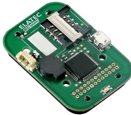
TWN4 MultiTech 3 HF (exemplary illustration*)

Multi-frequency HF RFID module with NFC support